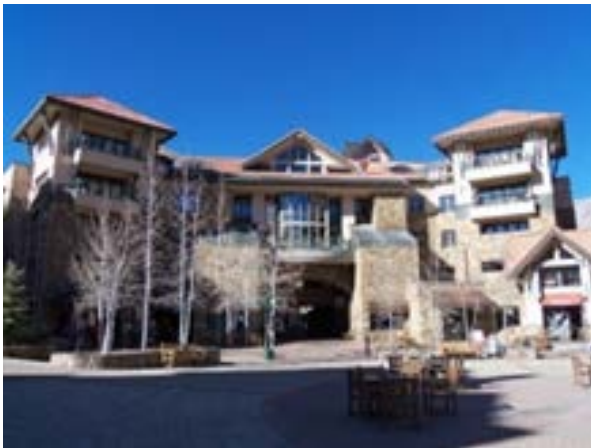
Franz Klammer Lodge, Telluride